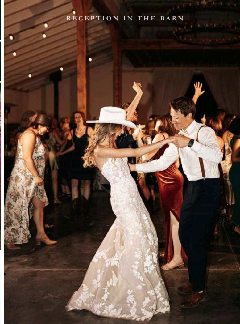
RECEPTION IN THE BARN