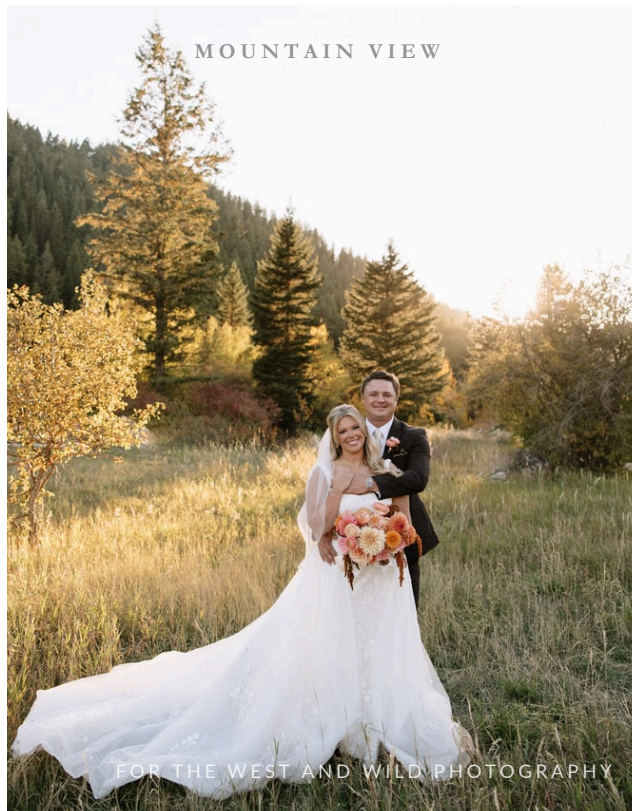
FOR THE WEST AND WILD PHOTOGRAPHY