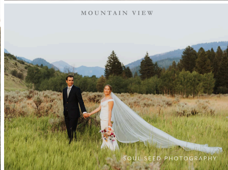
SOUL SEED PHOTOGRAPHY